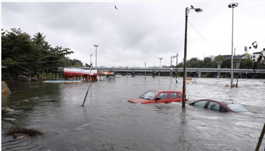
Lo-lying bridges in Pune are close to going underwater on Wednesday.

After a gap of two weeks, rain returned to Pune - city and district - raising the water levels of the Mula, Mutha and Pavana rivers. The heavy inflow of water forced dam authorities to discharge water from Khadakwasla, 27,203 cusecs at 9 am on Wednesday morning.